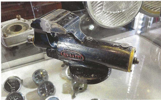
Every workbench needs a Bugatti vise.