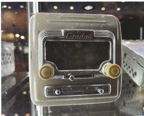
Style that makes music even when silent.