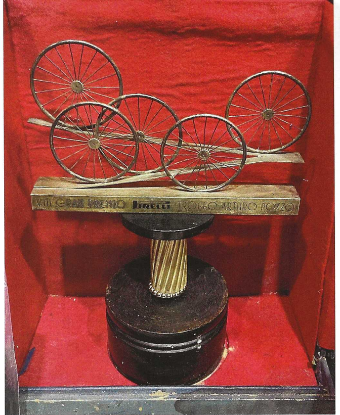
Even amateur cyclists won true art. This trophy is from 1956.