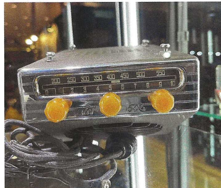
Sleek radio drama.