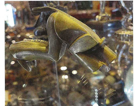
Art Deco mascot leaper in tails.