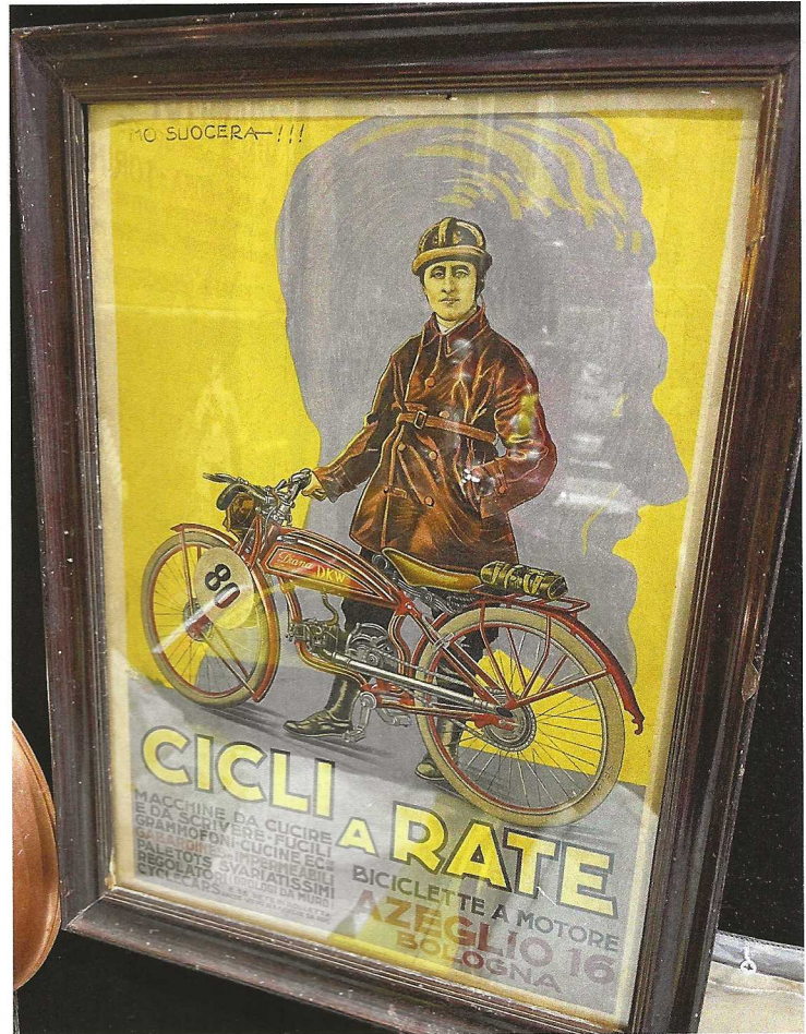
Seldom did installment payments seem this compelling.