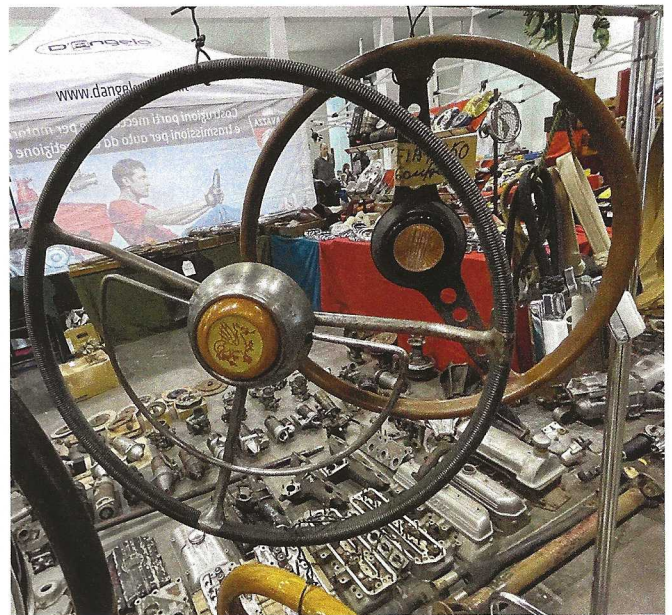
The steering wheel as art, circa 1946.