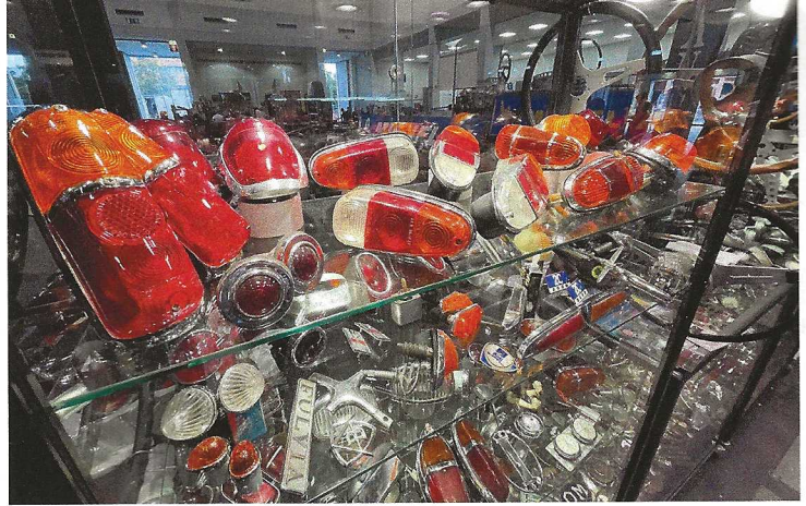
A group of lenses makes an aesthetic impact.